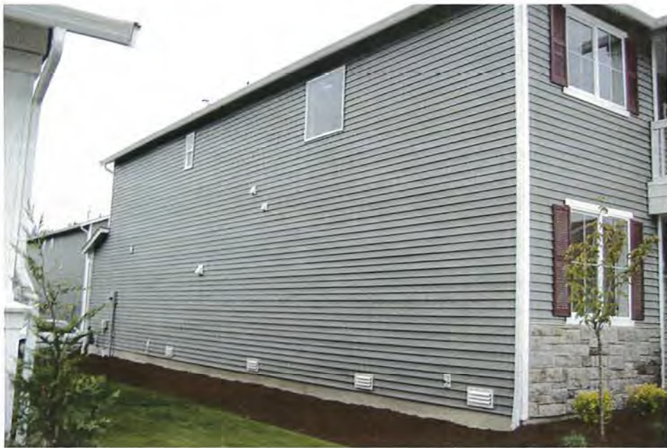
Lot 63 West Face 10-02-08