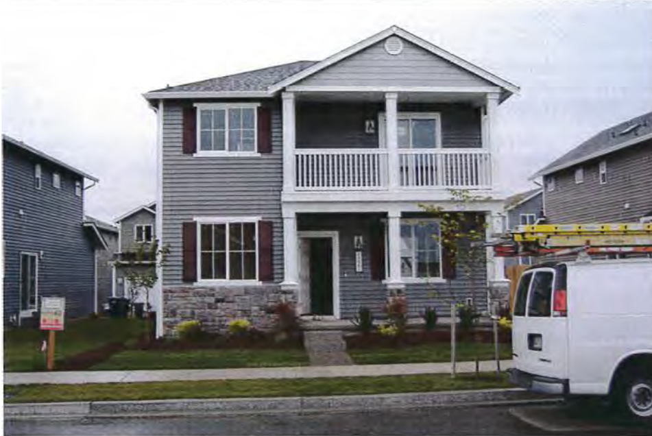
Lot 63 South Face 10-02-08

If using the Elevation Certificate to obtain NFIP flood insurance, affix at least two building photographs below according to the instructions for Item A6. Identify all photographs with: date taken; "Front View" and "Rear View"; and, if required, "Right Side View" and "Left Side View." If submitting more photographs than will fit on this page, use the Continuation Page, following.