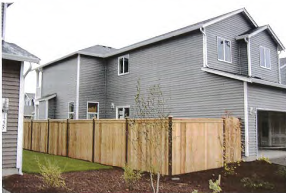
Lot 63 East Face 10-02-08