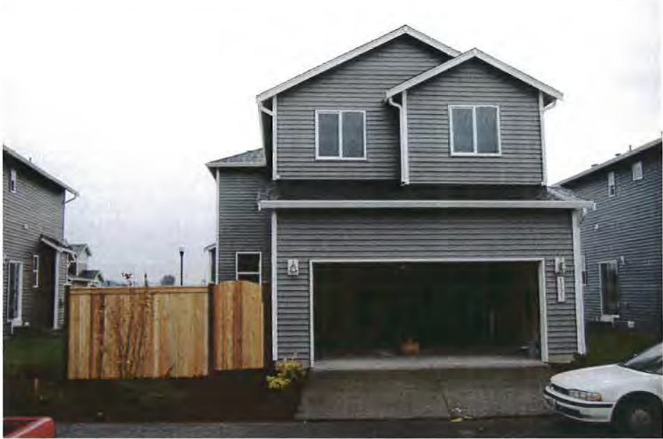
Lot 63 North Face 10-02-08

If submitting more photographs than will fit on the preceding page, affix the additional photographs below. Identify all photographs with: date taken; "Front View" and "Rear View"; and, if required, "Right Side View" and "Left Side View."